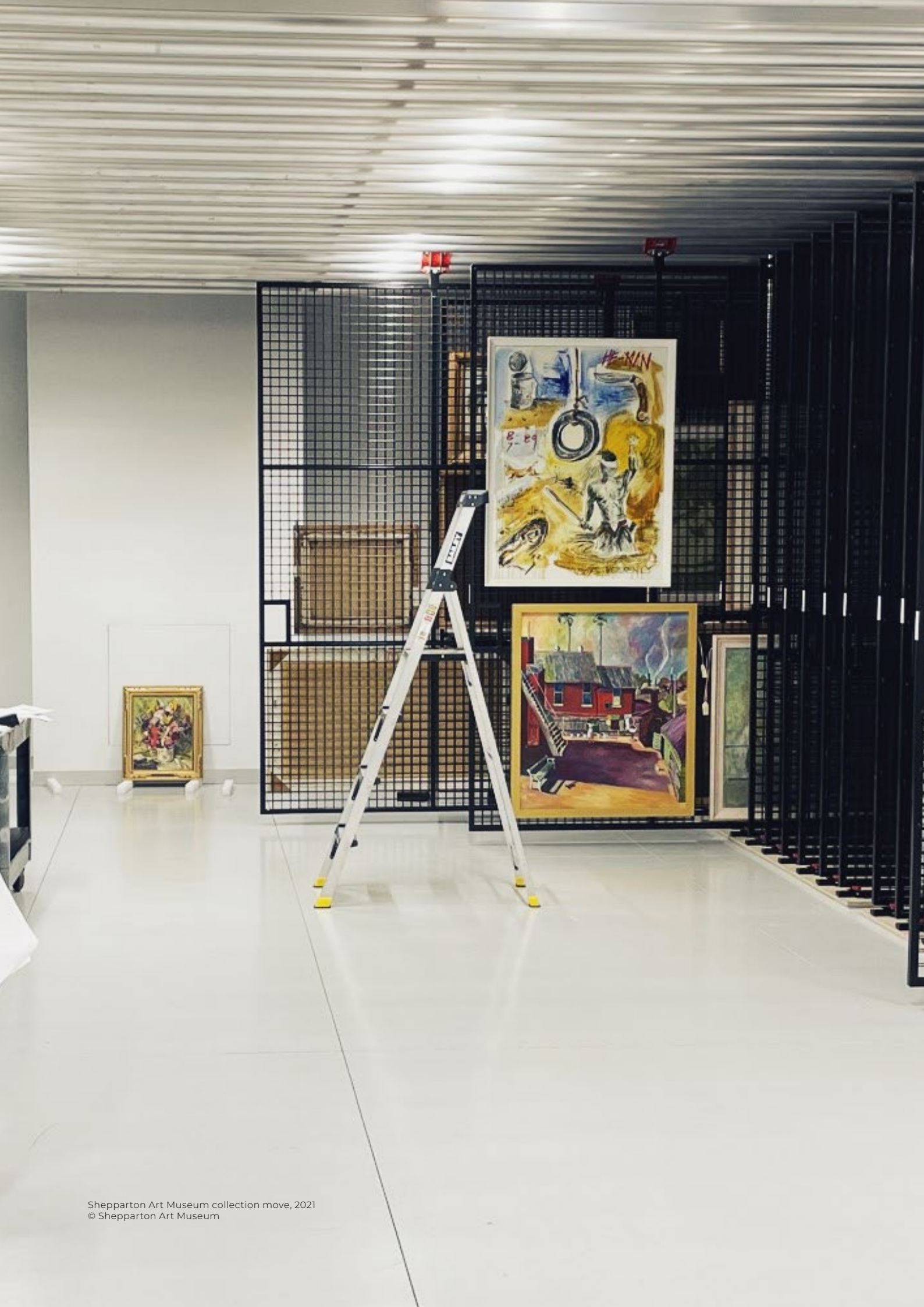
Shepparton Art Museum collection move, 2021